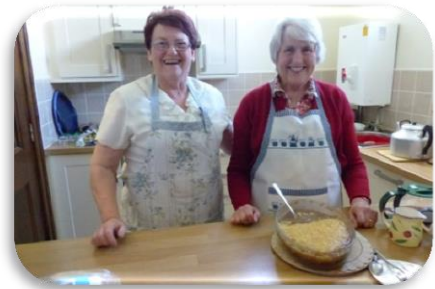
Our new kitchen

Christ Church is a very well-maintained Victorian building – in fact since the foundation stone was laid 4 days into Victoria’s reign it can claim to be the oldest Victorian church. It is next to an outstanding church primary school with 130 pupils on roll. The church has recently been reordered to include a disabled toilet, a kitchen, meeting room and space for refreshments. There is an open churchyard, although it will run out of space in the next