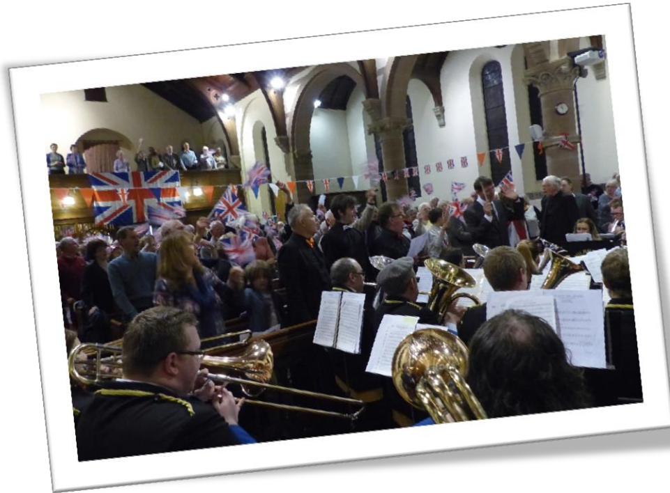
Last Night of the Proms - part of our annual calendar of musical events

There is a parish pastoral assistant who helps with visiting the sick and baptism families. There were 11 funerals in 2016 (including 4 burials in the churchyard). There were 2 weddings and 5 baptisms.