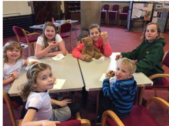
Children having fun at our monthly 'Sunday Lunch Club'.

We have recently built a disabled access ramp at the rear entrance of the church building.