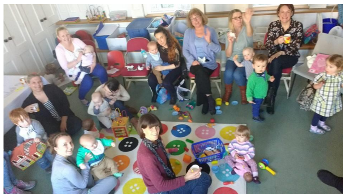
Childrens Church meets midweek every week at St Marys

In St Mary's church building we host Techie Heaven, Children's' Church, meetings of the prayer network and the Vision 2026 prayer group. We have strong links with the two community primary schools, grammar school and a private school which all lie within the parish boundary. Our Vicar is also the part-time Chaplain for the local community hospital and our lay assistants visit the local residential care homes and housebound to administer communion.