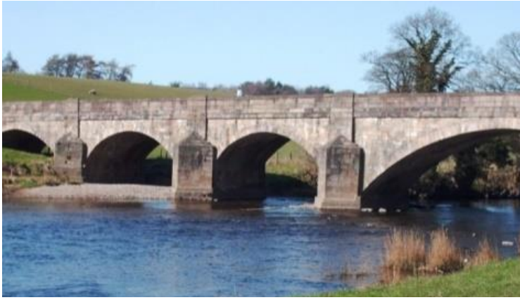
The scenic Edisford Bridge: a popular tourist spot