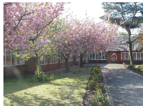
Edisford Community School, opposite St Pauls

The village of Low Moor has a cenotaph dedicated to those lost during WW1 and WW2. We hold an annual service on Remembrance Day and the incumbent is expected to host this. This is a very popular event attended by veterans and supported by our uniformed organisations.