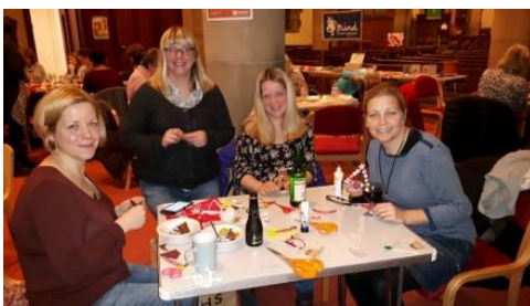
Enjoying a craft's evening in church

We operate an open church policy and visitors to Edisford Bridge and the camp site are very often seen having a look around our lovely building, especially during the summer months. St Paul's is a stunning building which is well maintained and currently in a good state of repair with a chapel that is dedicated to the Royal Engineers who were based at Low Moor during WW2.