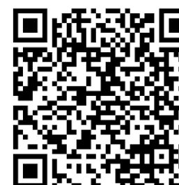
Prayer for Peace and Prayer Resources