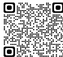
Year of Prayer Children's Resources