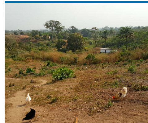
KIK has secured fertile land to build a school, offering hope to the orphans of Kailahun now and long into the future.

Your gift this time will bear rich fruit for the children in Kailahun.