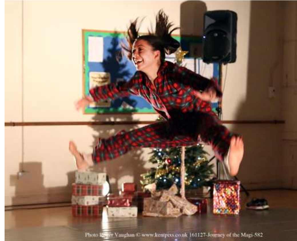
161127-Journey of the Magi-582