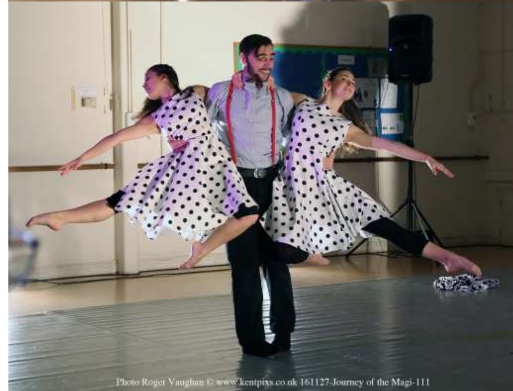
161127-Journey of the Magi-111